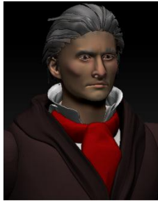
Ludwig van Beethoven