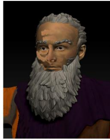
St. Brendan the Navigator