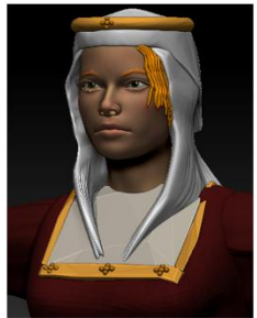
Queen Isabelle I.