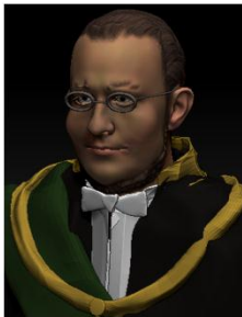
Camilo Benso the Count of Cavour